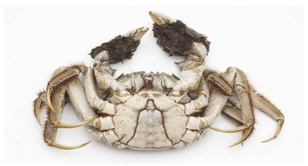
Chinese Mitten Crab, Eriocheir sinensis

This is perhaps the most important section. Here you outline the actions you plan to take to improve your biosecurity. What you choose to do will vary depending upon the activities and partners involved and the risks associated both with the activities and the site. Aim to stay practical – you can always include a 'wish list' of other actions should time and budget allow.