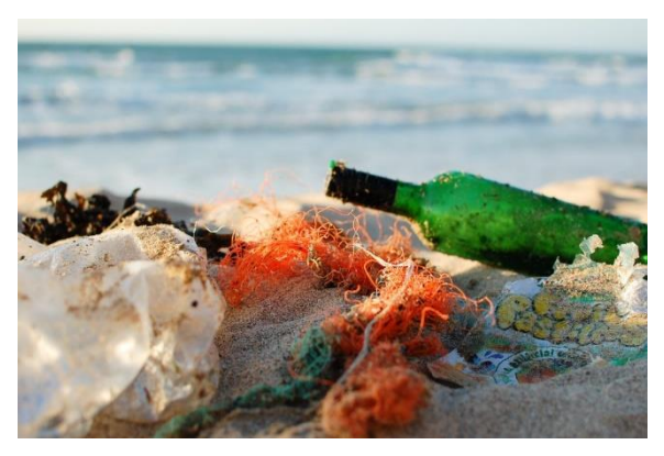
Marine litter, image courtesy of Scrapbook.co.uk

Litter in the marine environment is hugely damaging and has now become more recognised as socially unacceptable. Boaters are generally more aware of the need to not let anything go over the side so active littering is unusual at marine events. Nevertheless food wrappers and other refuse can still end up in the sea if not carefully managed.