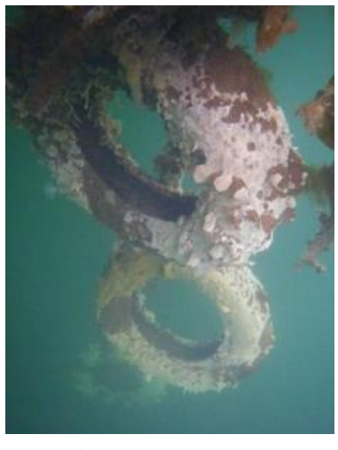
INNS Didemnum vexillum on unused tyre fenders.

Avoiding this situation is not as difficult as you might think. Legislators have simply requested people to 'follow best practice', allowing users to define the most appropriate actions. By introducing practical measures to reduce biosecurity risks as you plan your event you will soon discover that it becomes second nature and saves you a lot of effort in the long run.