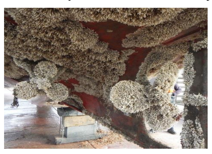
Ficopomatus enigmaticus on a boat hull

The RYA is very concerned about the impact of Invasive non-native species (INNS), also known as alien species, which are increasing across the UK, both in the sea and on the land. More than 10 per cent of Great Britain's land area or coastline now has established populations of invasive species. As well as the devastating environmental impacts, non-native species can spread disease, restrict navigation, block waterways, clog up propellers and add significantly to the